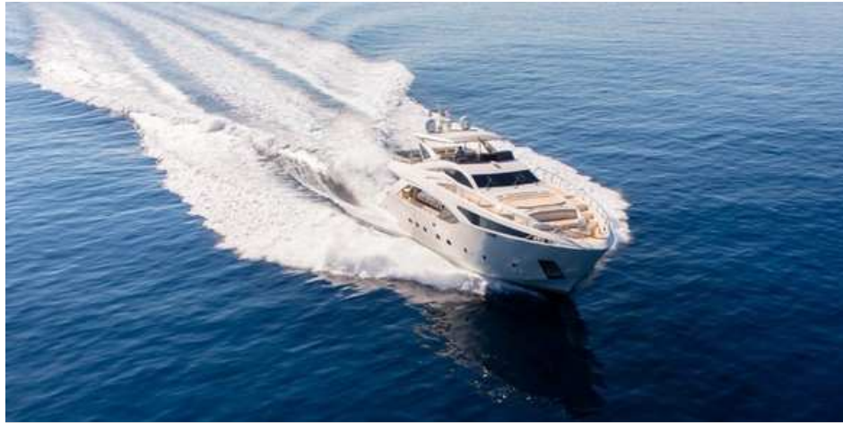
PerMare Introduce New Amer Cento Yacht Line